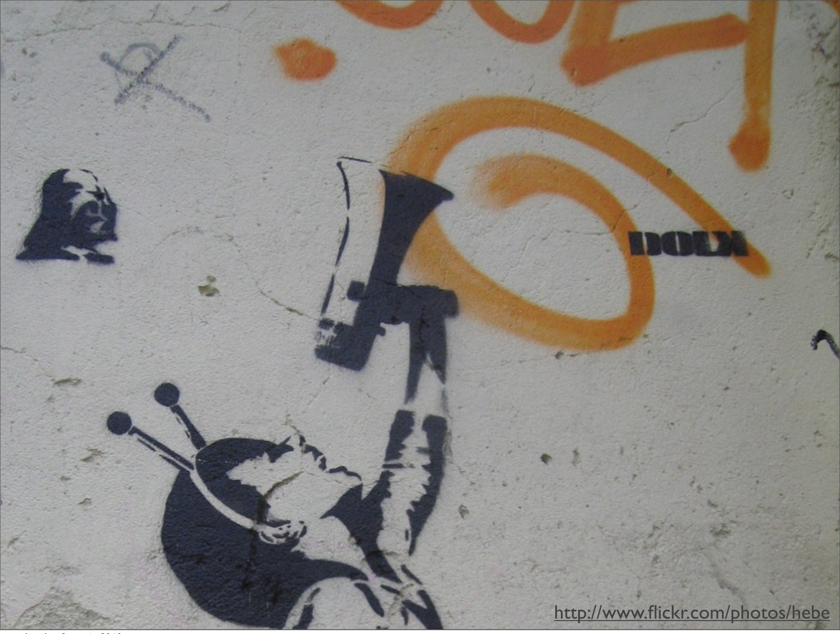
onsdag den 3. marts 2010