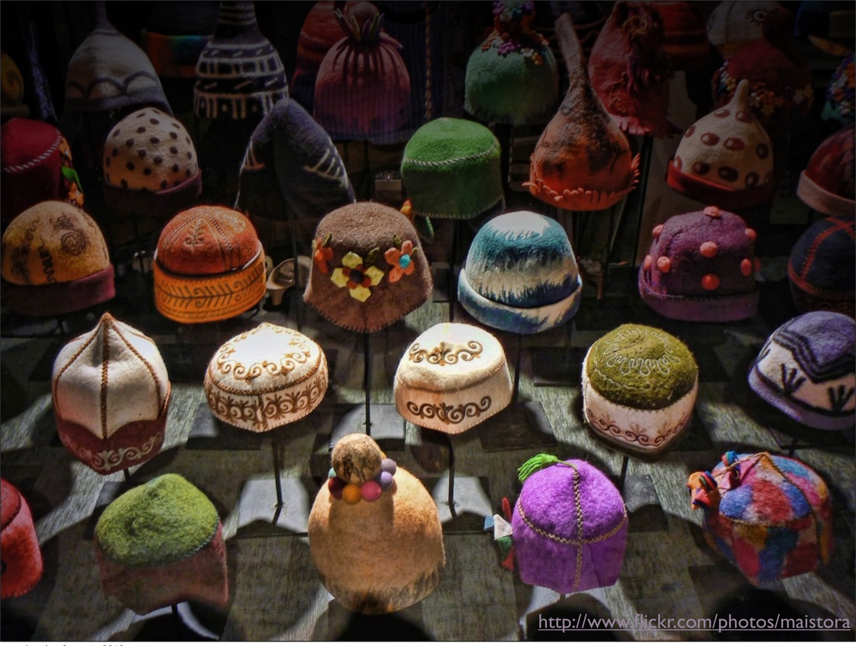
onsdag den 3. marts 2010

people from all walks (places, experience, perspective) make Drupal go remember that they are real people, not just names in cyberspace all volunteers who just step up