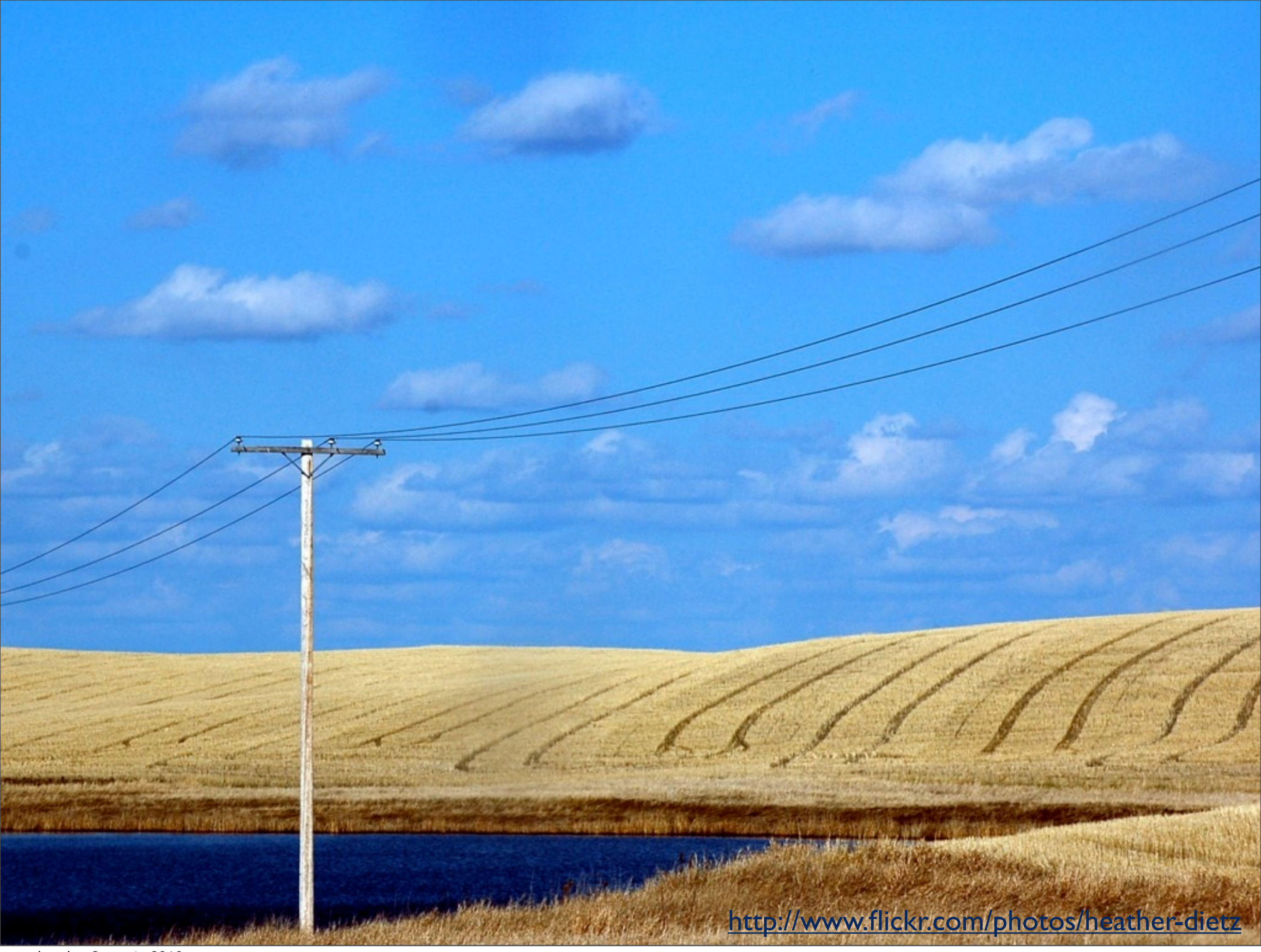
onsdag den 3. marts 2010